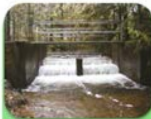
Fish Passage Correction