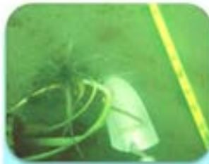
Aquatic Plant Control