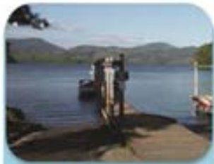
Boat & Equipment Access