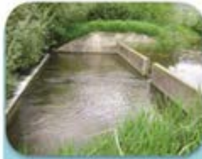
Flood Control Devices