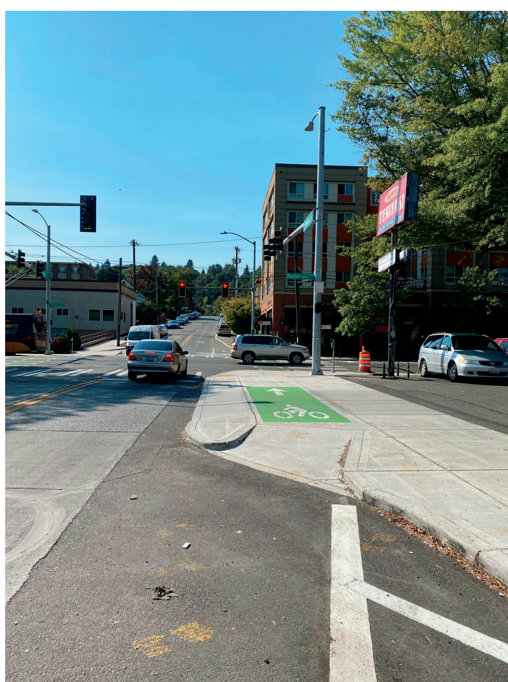
Bulb-out with bike ramp