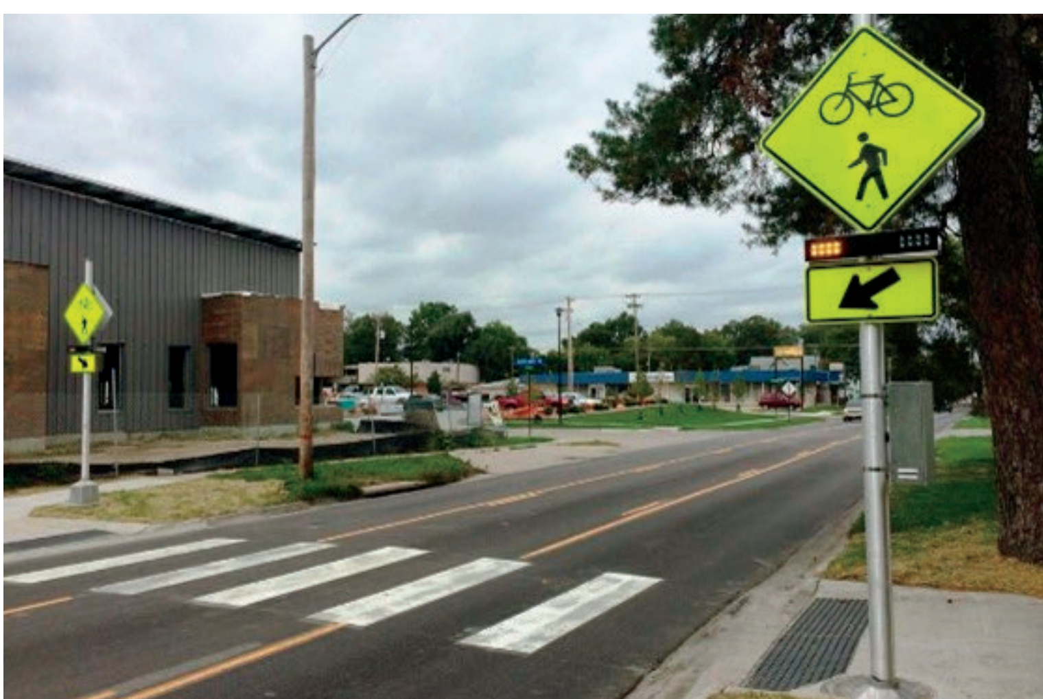
Example of a RRFB